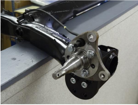
Figure 3: Stub Axle Installed (Front View)