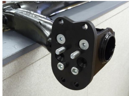
Figure2: 35mm of Drop