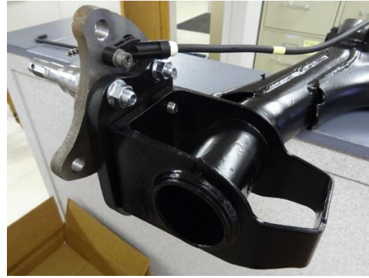
Figure 4: Stub Axle Installed (Rear View)